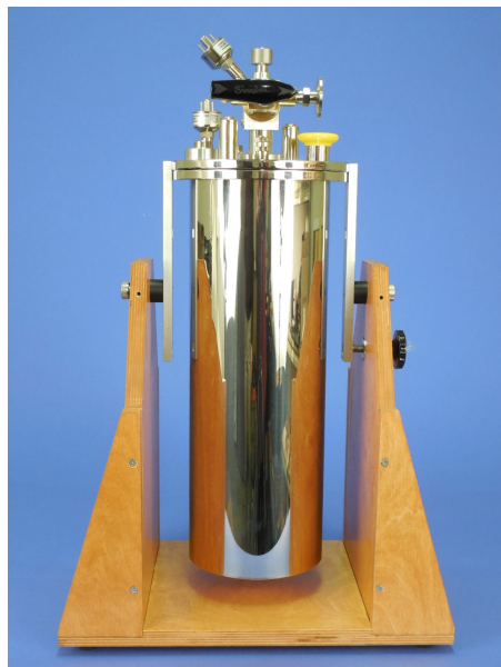
Figure 1: Picture of the cryostat.